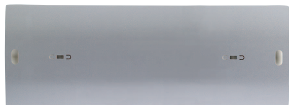
150 mm (6 in) slat.