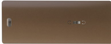
Bronze - HOR 7140.