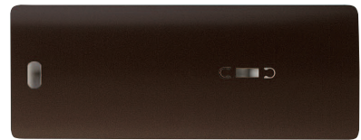
Dark Brown - RAL 8019.