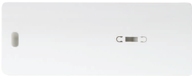
White - RAL 9016.