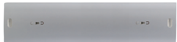
100 mm (4 in) slat.