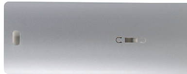
Silver Pearl - RAL 9007.