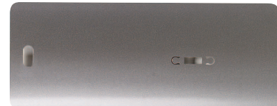
Storm Pearl - HOR 7043.