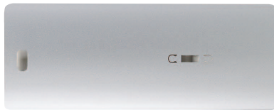
Light Silver - RAL 9006.